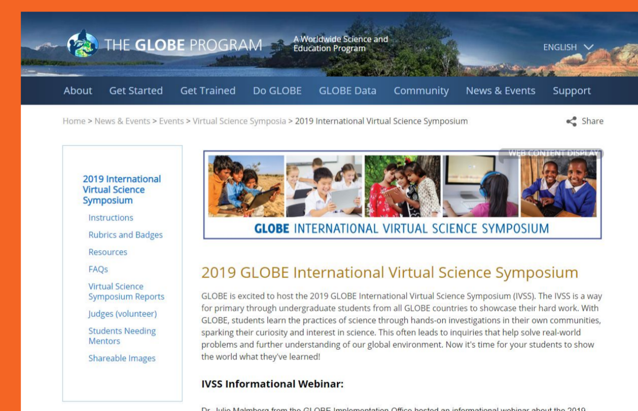
GLOBE IVSS is a global platform for constructivist learning.