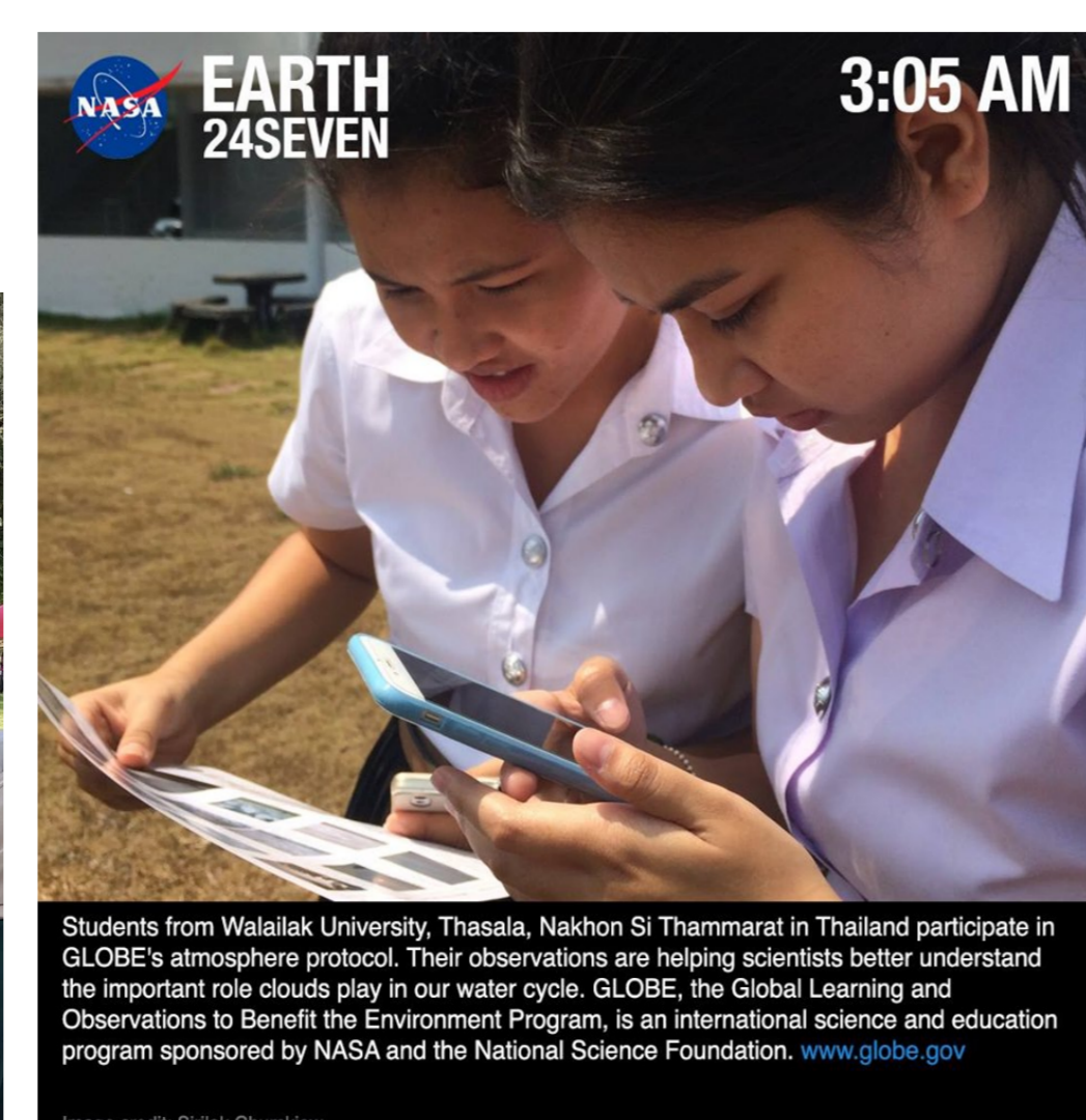
Students using NASA GLOBE App to share their learning globally.